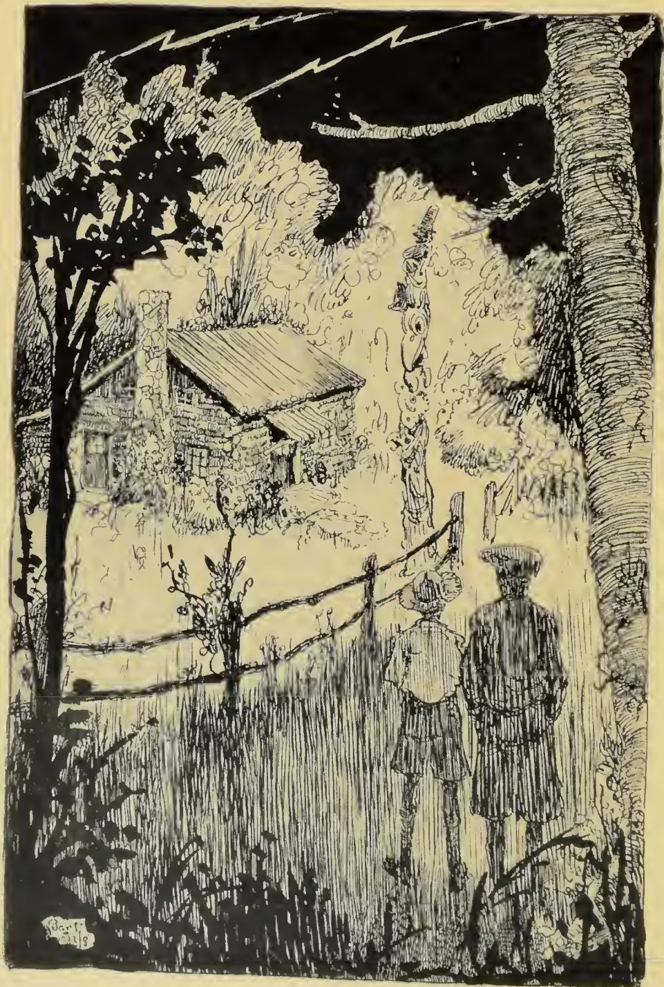
POPPY AND RORY WERE SQUINTING AT THE BIG TOTEM POLE. Poppy Ott and the Tittering Totem. Frontispiece (Page 220)